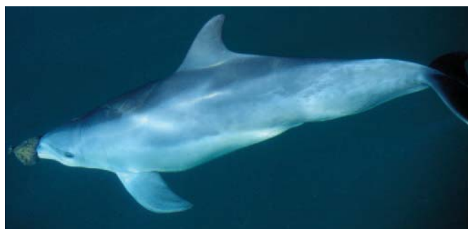
Fig. 1. Wild bottlenose dolphin foraging with marine sponge.

an interesting new dimension to the mapping of cultural phenomena among animals by showing that unlike in apes, tool use in this population of bottlenose dolphins is limited almost exclusively to the social transmission within a matriline that is part of a larger population.