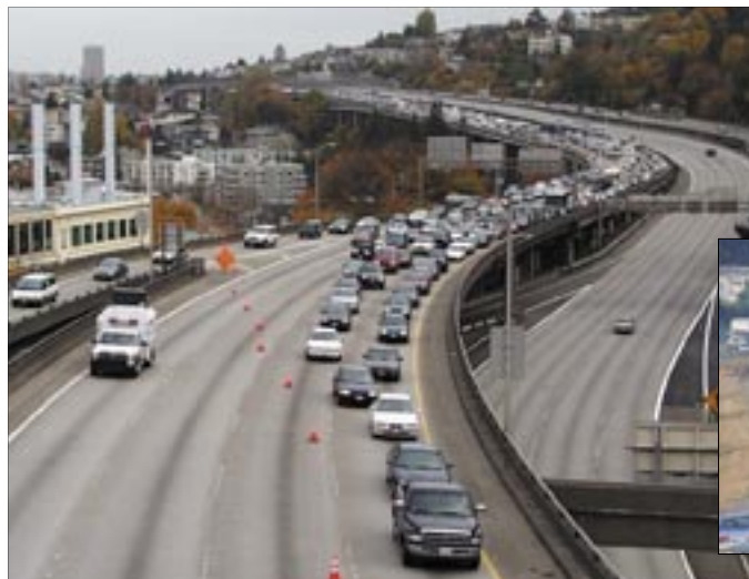
Incident-caused congestion; Southbound Interstate 5 in Seattle (WSDOT Incident Response truck working at the scene).

gestion relief investments, with a focus on measuring travel time, distinguishing between congestion caused by incidents (“non-recurrent” congestion) and congestion caused by inadequate capacity (“recurrent” congestion), and measuring travel time reliability.