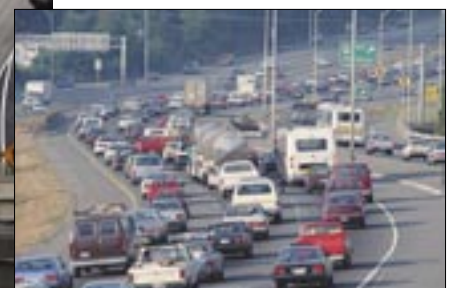
Non-incident-related congestion; Northbound Interstate 405 near Seattle.