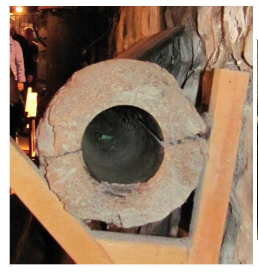
Figure 2: A cross-section image of a wooden pipe.