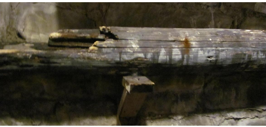
Figure 3: Side View of a Wooden Pipe