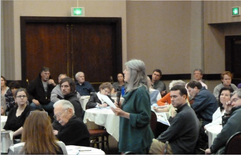
2011 Hanford State of the Site Meeting, Portland, Oregon