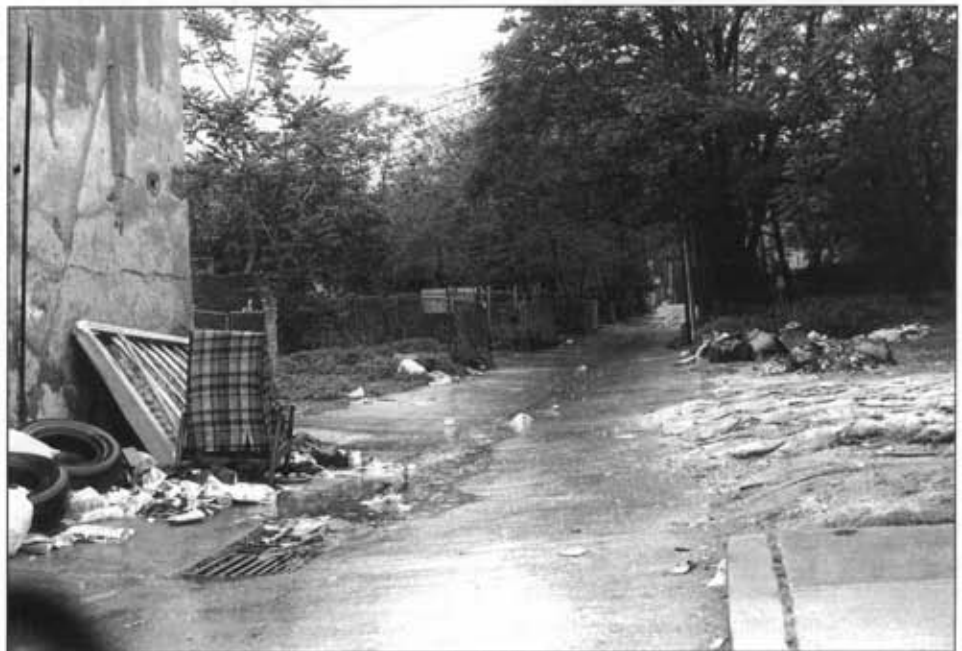
Example of an alley in Zone 1 that contributed to rodent infestation prior to implementation of the rodent control program in Baltimore, Maryland.

neighborhood, which had 1,160 residences, to develop and test neighborhood involvement programs and the integration strategies of the Departments of Housing and Health and the Bureau of Solid Waste.