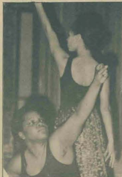
Tribute to Working Women pg. 4