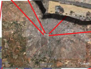
THE CITY OF SEVILLE