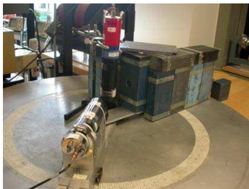
Figure 2: Scattering table used for Compton scattering. NaI detector is mounted on a movable arm. The target is a plastic scintillator detector suspended vertically over the table's center. The source is behind the lead bricks inside a lead-wrapped tube.

the multichannel analyzer. For this experiment we use a pulse height analyzer with a gate input. The gate allows one to measure input pulses only when the gate input is “asserted” (usually by going high) with a logic-level pulse.