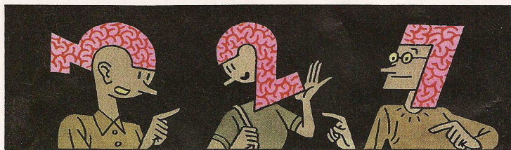
According to Stanislas Dehaene, humans have an inbuilt "number sense" capable of some basic