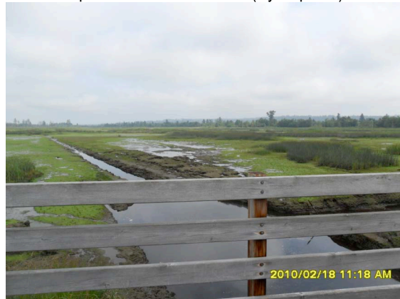
Spencer Island at low tide