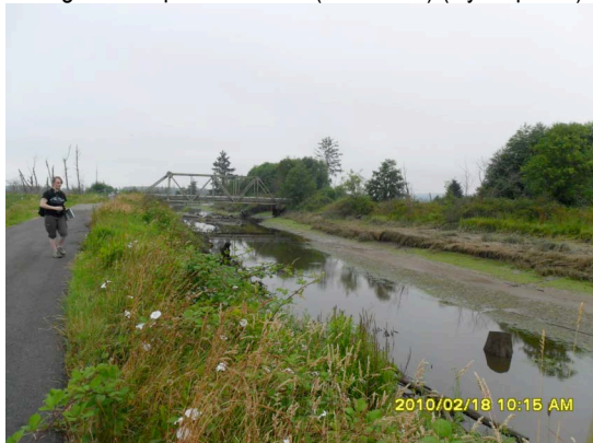
Bridge onto Spencer Island (& Cherise)