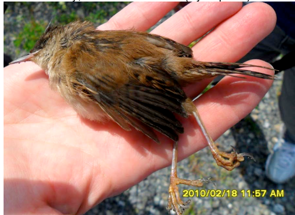
Sadly, a dead Marsh Wren