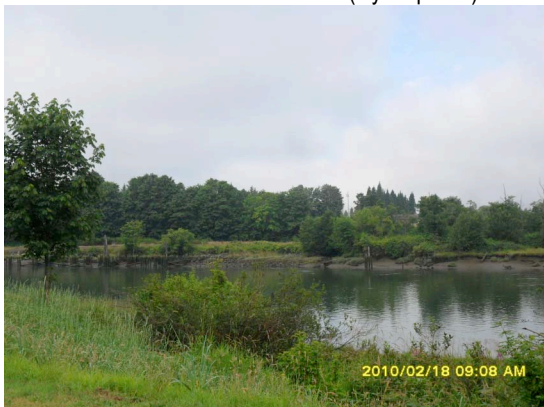
Snohomish River at low tide