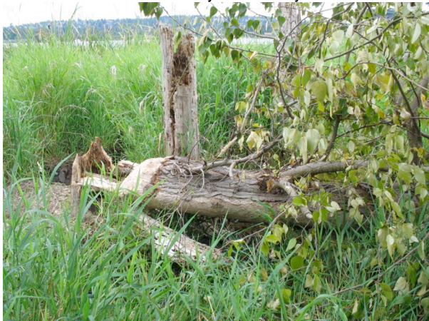
The tree was recently cut down by Beavers.