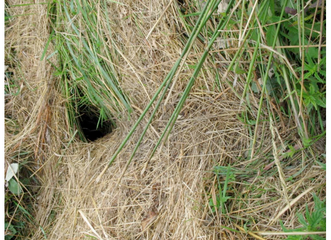
Burrow that I suspect belongs to a Nutria.