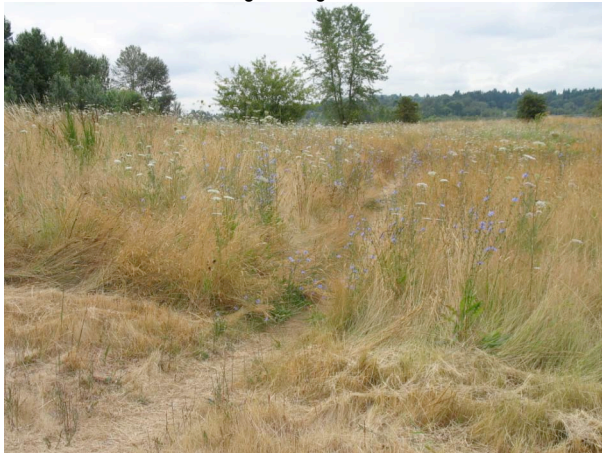
A few flowers amongst the grasses in the meadows!