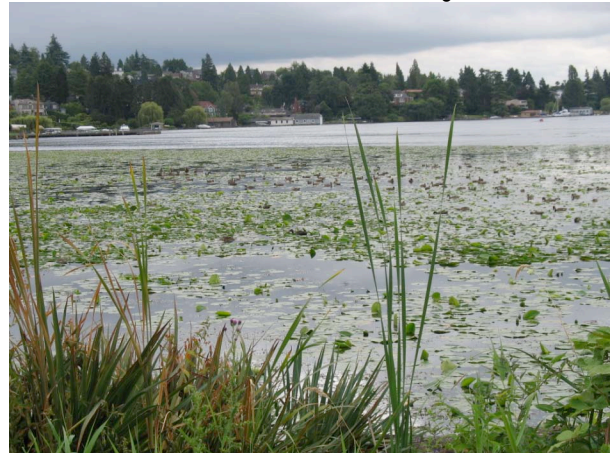
Woodducks, Mallards & Gadwalls galore!