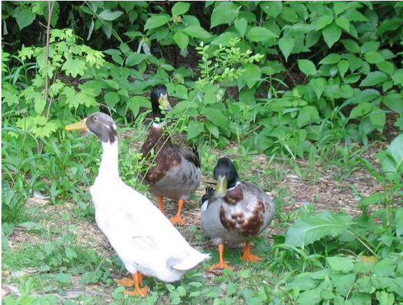
Male Mallards are starting to molt (+ Domestic-Mallard cross)