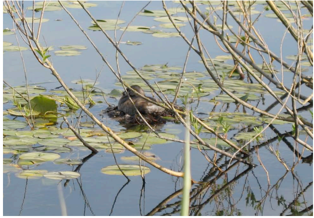
Pied-billed Grebe sitting on its nest.