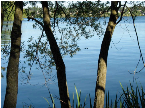
Pied-billed Grebes with young chicks!