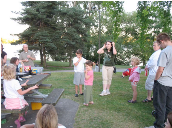
Folks from Bats Northwest introduced kids to the bats.