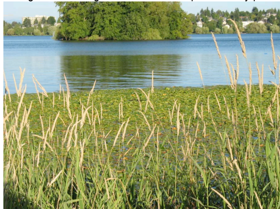
The grebe's floating nest is the brown spot in the lily pads.