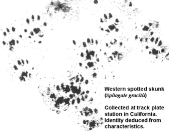
Western spotted skunk ( Spilogale gracilis ) Collected at track plate station in California. Identity deduced from characteristics.