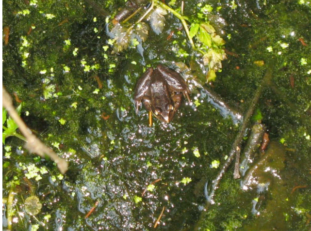
Red-legged Frog at Salamander Pond