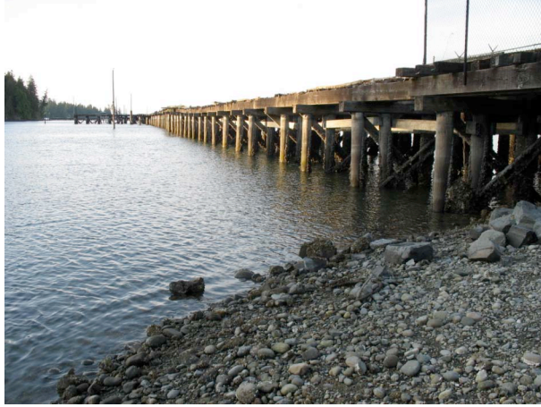
Maternity colony of Yuma Myotis bats live under the old pier.