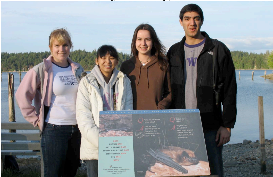
We had to wait till 9:30, but the Yuma Myotis came out in force!!