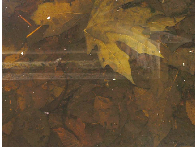
Dim photo of a Rough-skinned Newt in the pond.