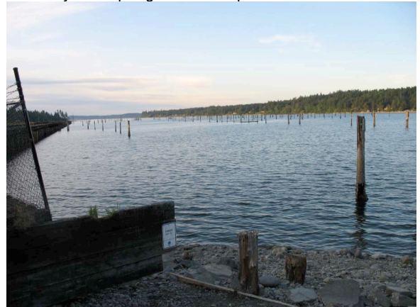
Many of the pilings house Purple Martin nest boxes.