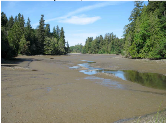
The Woodard Bay Natural Area has old second growth forest.