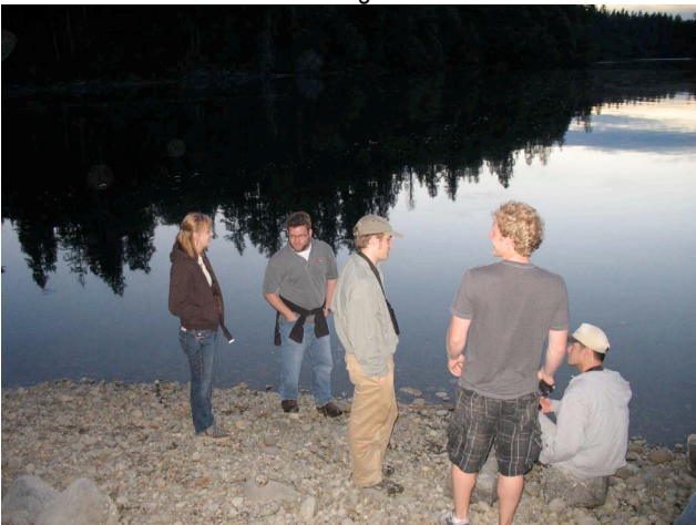
More waiting for bats: