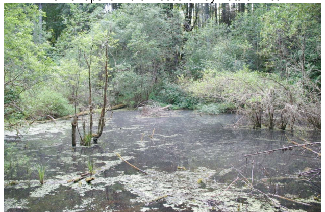
The Newt pond in the Woodard Bay Natural Area.