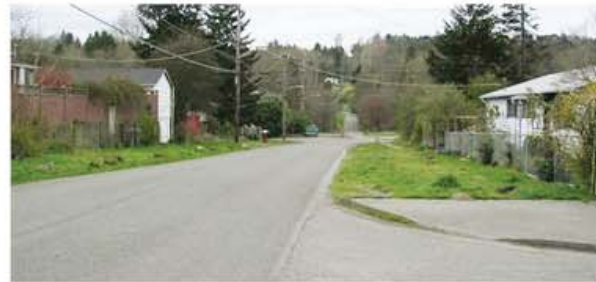
Figure 5.25: The East-West Pedestrian Connection