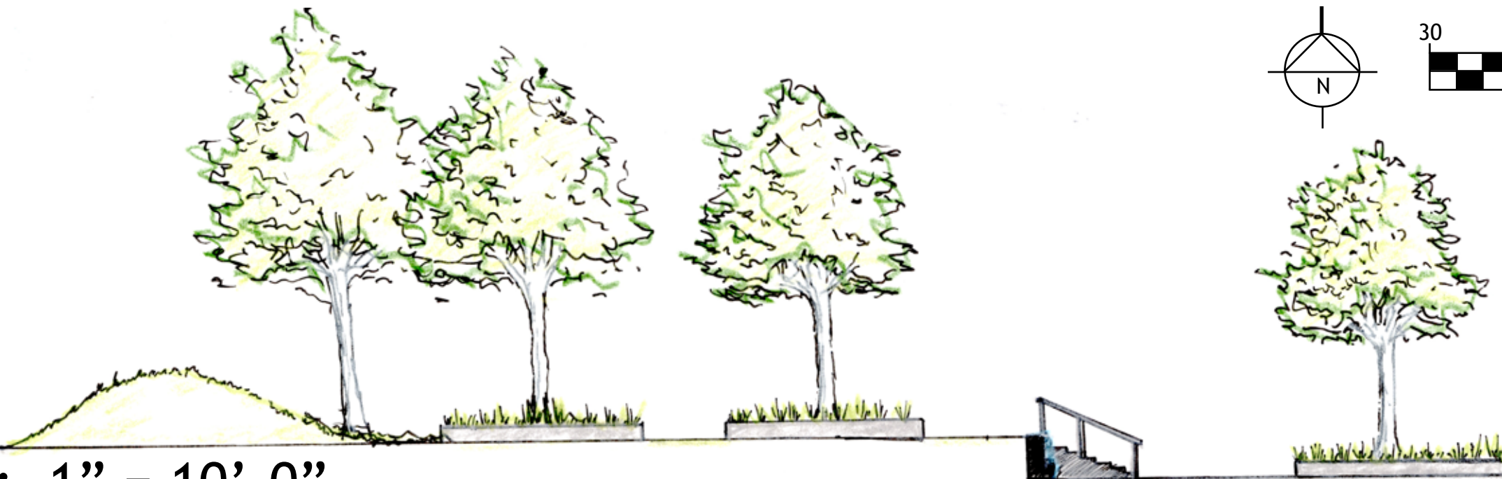
Section B: 1" = 10'-0"