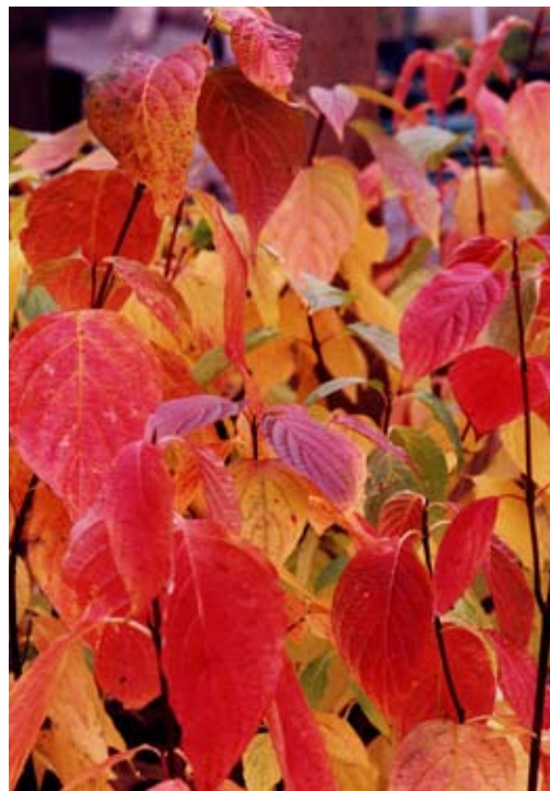
Red Osier Dogwood