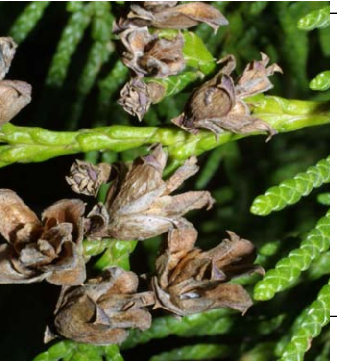
Western Red Cedar