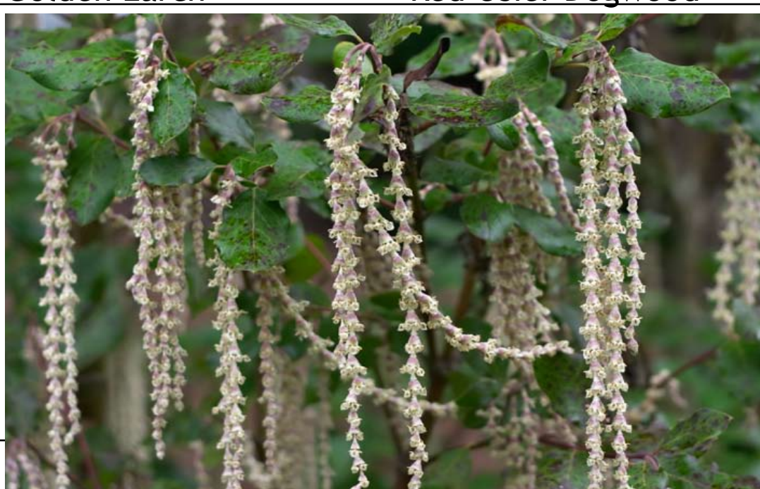
Coast Silk Tassel