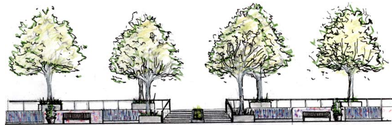
Section A: 1" = 10'-0"