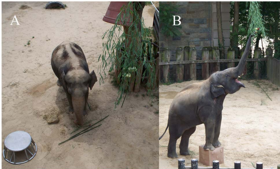
Figure 1. Elephants in Experimental Conditions. (A) An overhead view of the positioning of the elephant tub, sticks and suspended baited branch, with one of the adult female elephants. (B) The juvenile male, Kandula, standing on the cube and reaching for the branch baited with food. doi:10.1371/journal.pone.0023251.g001

ever been observed moving objects to stand on to obtain food. The 33-year-old female had been observed moving and standing on objects to reach items several times in her adolescence, but not since then, nor since the birth of her son, Kandula.