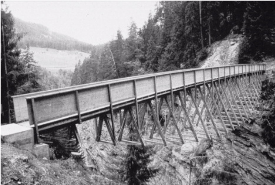
Figure 2. Traversina Bridge, Switzerland, by Juerg Conzett (1996)

dramatically reduce life cycle costs by decreasing maintenance and allowing for salvage or disposal at the end of life. By reducing life cycle costs, engineered structures can become much more sustainable than current practice. This is an obvious goal for engineering design, which can provide measurable improvements in the economic and environmental performance of construction. As an example of a more sustainable structure designed for improved life cycle performance, Joerg Conzett's Traversina Bridge in Switzerland was designed to be built using small sections of locally available timber (see Figure 2). A key design constraint was the need to replace any single piece of the structure without a need for auxiliary support. In this way, the structure could be maintained indefinitely using locally grown timber. This explicit design goal helped to achieve an elegant structure with low life cycle costs and improved environmental performance.