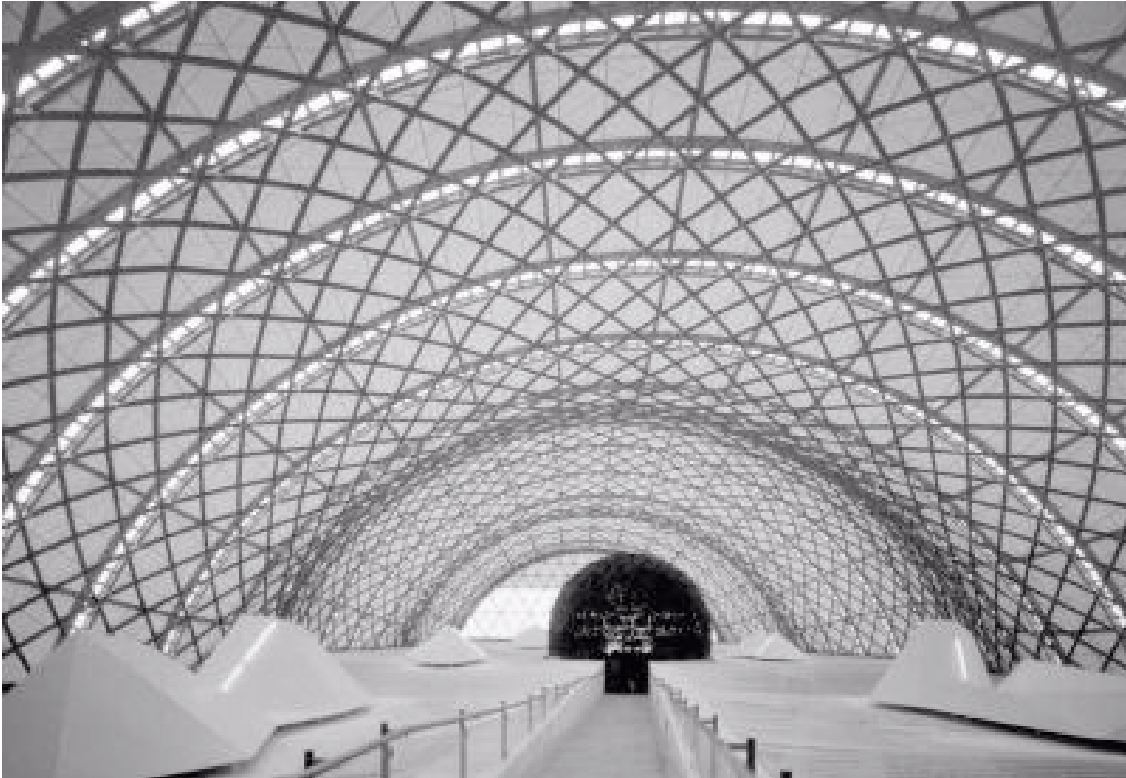
Figure 4: Japanese pavilion at the Hannover Expo by Shigeru Ban and Buro Happold

recycled at the end of the exposition. The architect Shigeru Ban worked closely with the engineering firm of Buro Happold to develop and implement the structural system composed of paper. In addition to the creative use of structural cardboard, the pavilion was supported by simple temporary foundations made of wood and sand, which could be easily removed at the end of the exhibition. Particularly for buildings with a short life span, engineers should explore alternative materials which achieve the engineering objectives of efficiency and economics, while reducing the environmental impact of construction.