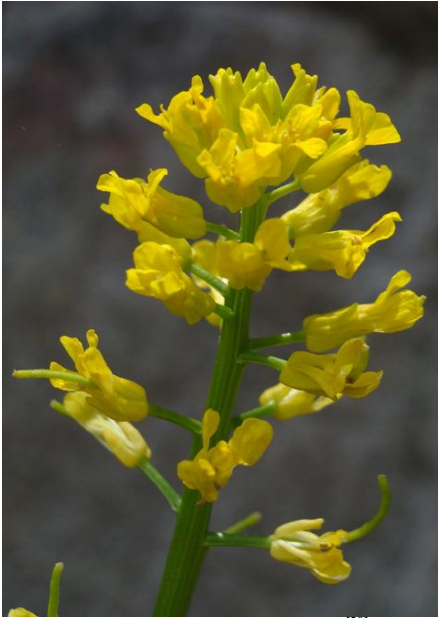
Barbarea orthoceras flower [20]