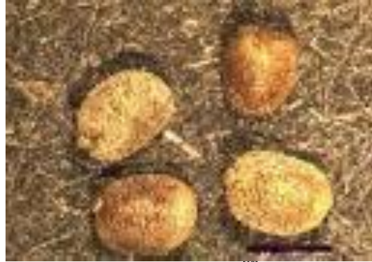
Barbarea orthoceras seeds [19]