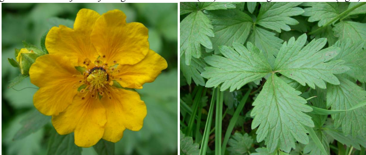
Figure 2. Photo of Potentilla flabellifolia flower (left) and leaves (right) .