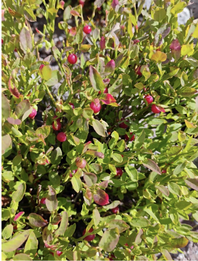
Burke Herbarium Image Collection (Giblin, 2024)

URL: https://courses.washington.edu/esrm412/protocols/[2025]/[VASC.pdf]