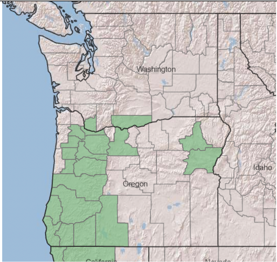
Figure 1 Wyethia angustifolia (DC.) Nutt. distribution. From a map by Esri, USDA-NRCS-NGCE & NPDT, 2014. © Esri, 2014. 2