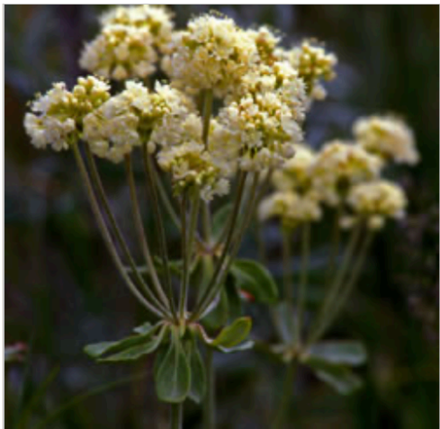
Eriogonum heracleoides var. heracleoides .