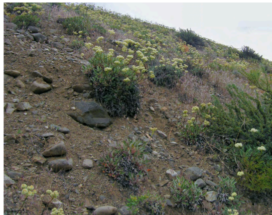
Figure 3. Parsnipflower buckwheat growing in rocky soils in Oregon.