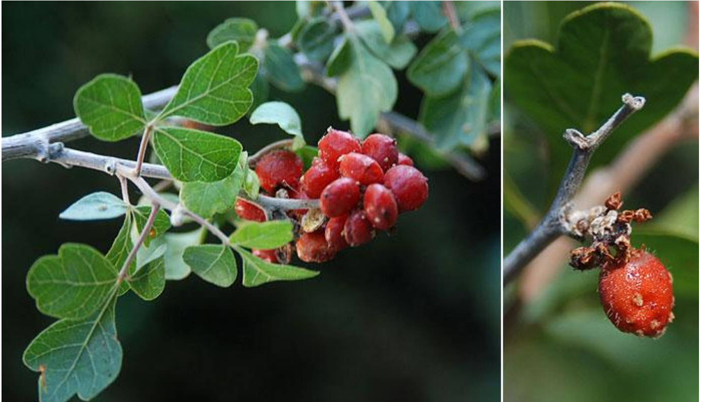
Leaves and fruit. 11

URL: https://courses.washington.edu/esrm412/protocols/2026/RHTR.pdf