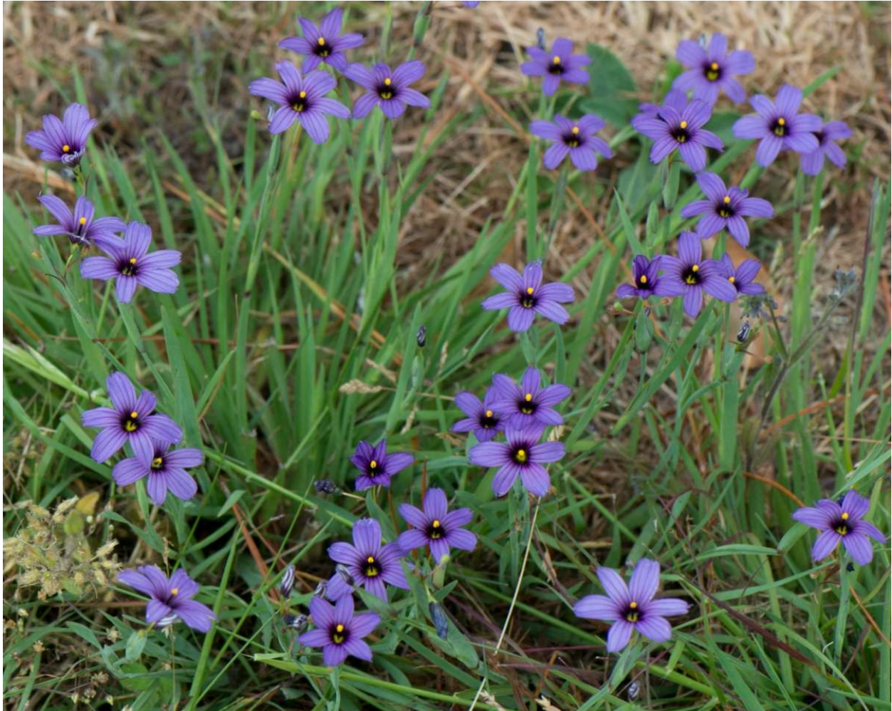
Western blue-eyed grass ( Sisyrinchium bellum ) mature plant with inflorescence

URL: https://courses.washington.edu/esrm412/protocols/2026/SIBE.pdf