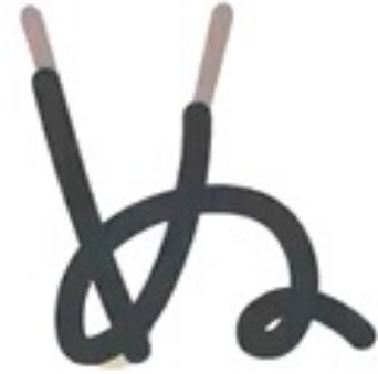
CHOPSTICKS HOLDING SOME NOODLES