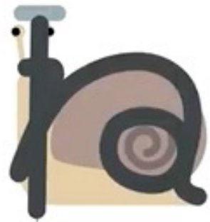
SNAIL HIDING BEHIND A NAIL