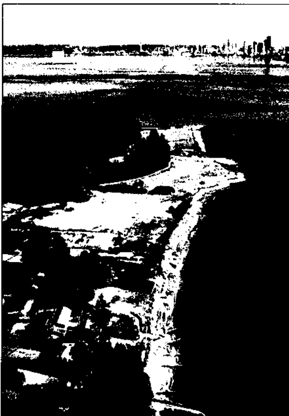
An uplifting site. Oblique view of an uplifted marine terrace at Restoration Point. The platform, which underlies the grass-covered surface in the central part of the photograph, was abruptly uplifted 7 meters, probably during a large earthquake that occurred 1000 to 1100 years ago. A view to the east across Puget Sound toward Seattle is shown.

seismology is the study of the evidence for prehistoric earthquakes—before the direct evidence of historical observations and instrumental seismograms were available—and it has been an extremely useful field in North America, which has a relatively short historical record. Early workers stud-