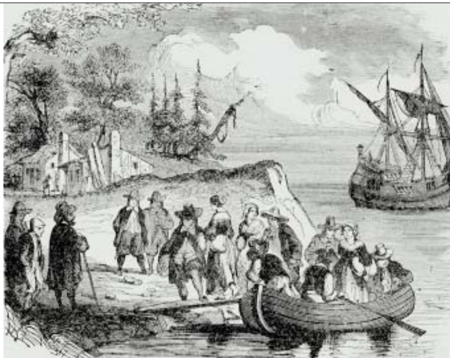
Dutch settlers arrive on Manhattan Island.

If institutions are so important for economic prosperity, why do some societies choose or end up with bad institutions? Moreover, why do these bad institutions persist long after their disastrous consequences are apparent? Is it an accident of history or the result of misconceptions or mistakes by societies or their policymakers? Recent empirical and theoretical research suggests that the answer is no: there are no compelling reasons to think that societies will naturally gravitate toward good institutions. Institutions not only affect the economic prospects of nations but are also central to the distribution of income among individuals and groups in society—in other words, institutions not only affect the size of the social pie, but also how it is distributed.